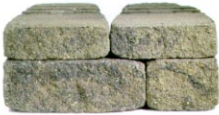
Three different unit sizes are used to create a random appearance similar to natural stone walls.

The Mosaic ™ Retaining Wall System utilizes units of varying heights and widths to achieve a random-like pattern. While complicated in appearance, installation is amazingly simple. Like all Versa-lok products, units are easily assembled without mortar, require no concrete footings, and are environmentally safe. The Mosaic ™ retaining units also undergo a “weathering” process to create a rustic old-world appearance that closely resembles natural stone.