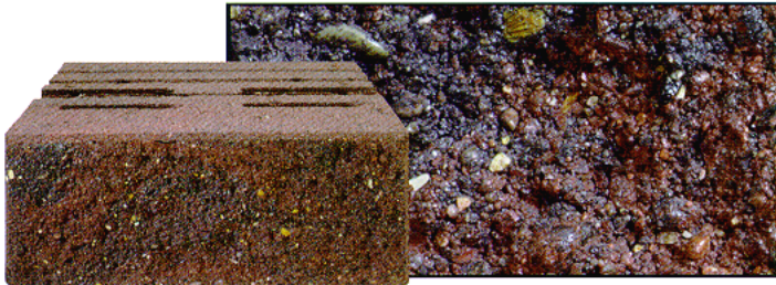
ROSE CREEK BLEND